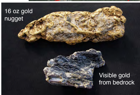
Specimens from Otter Creek on Gray Rock's Surprise Lake Property

Based on geochem results and grab samples, the current target extends for 1.2 kilometers with a width of at least 800 meters.